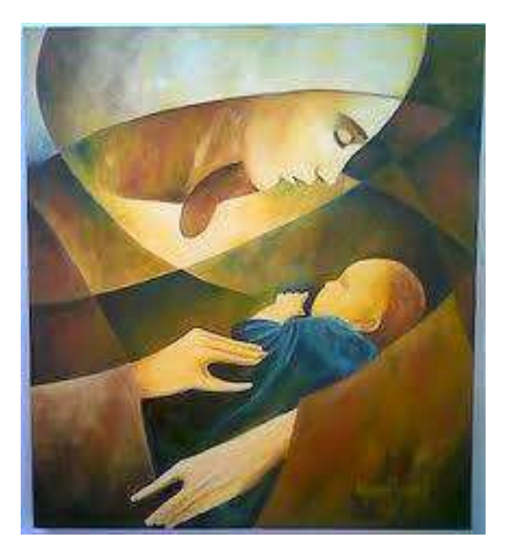
"Nativité Paroiisse Sacré Cœur" Paray-le-Monial France